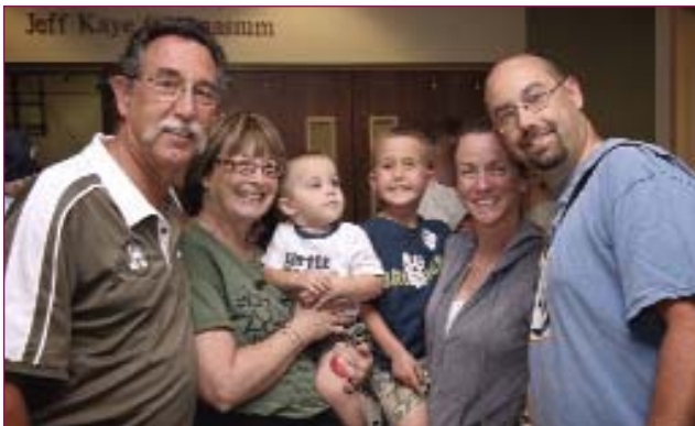
The JCC serves all residents of the community regardless of faith, age or disability.

The DPJCC is proud to offer all active military personnel, their spouses and dependent children a gratis JCC membership throughout their active military status.