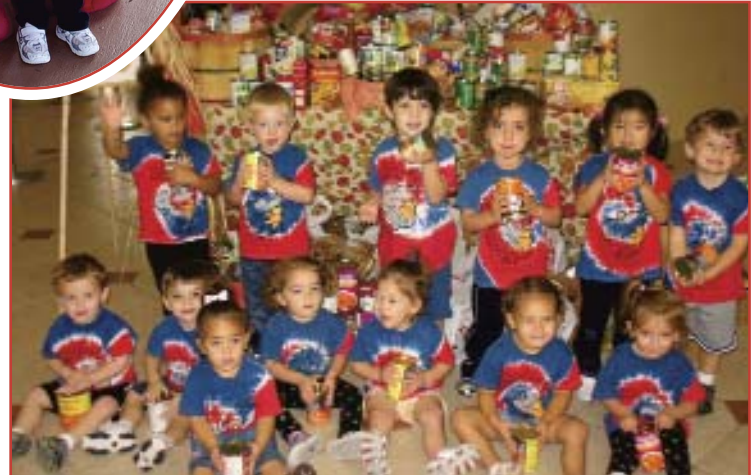
Donating for mitzvah project