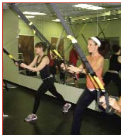
TRX® Suspension Training®