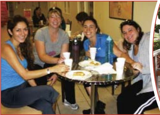
Pancake breakfast at the J