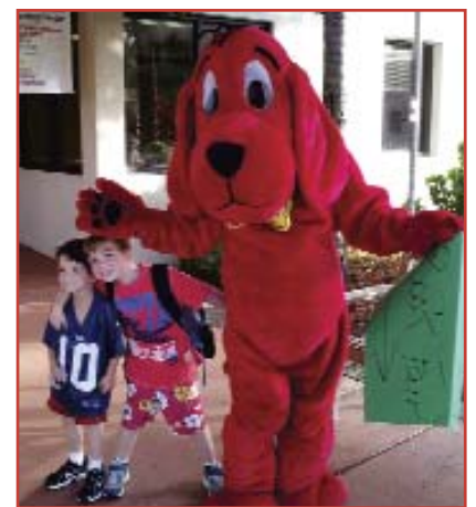
A man's best friend