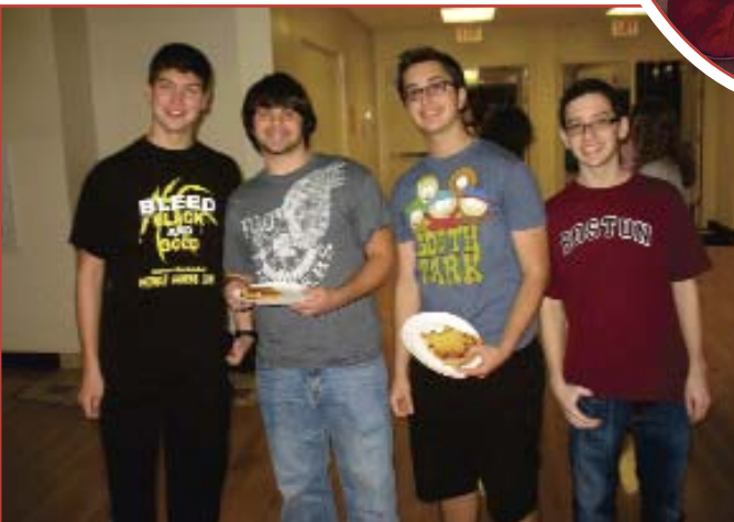
Just hangin' at the J