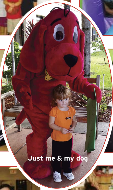
Just me & my dog