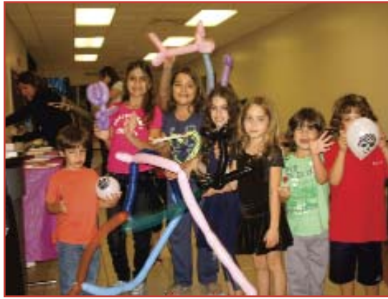
Registering for camp