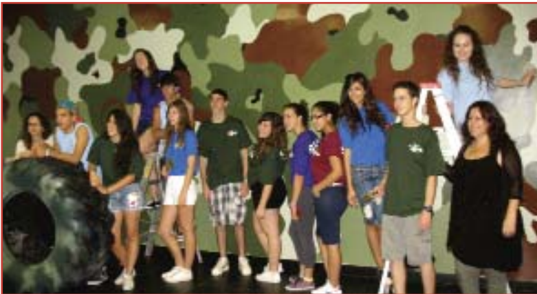
The Bunker at the J