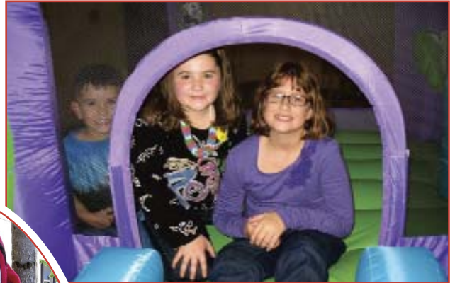
At camp kick-off